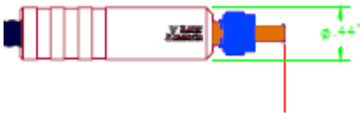
Typical Output Connector Detail